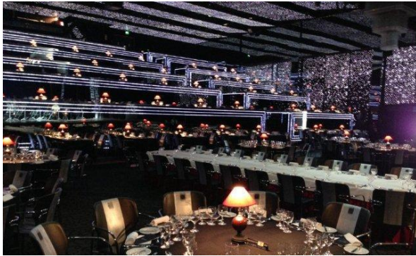
8.30 pm Gala Dinner at Páteo da Galé