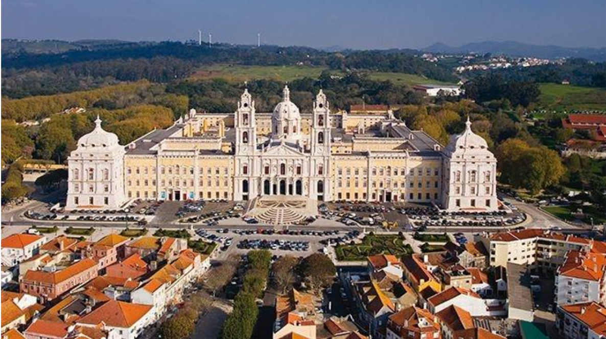
Maфра National Palace and Convent

1.30 pm – Farewell lunch in the cloisters of the convent, with entertainment 5.00 pm – End of the conference and return to the hotels