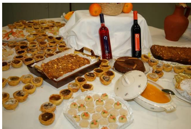
CEUCO Associations Enogastronomic Show