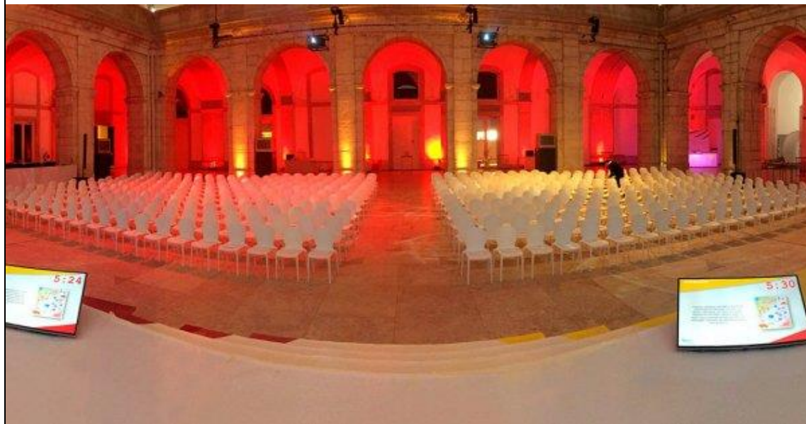
Páteo da Galé