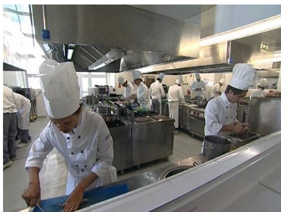
Exhibition of high-quality agri-food products